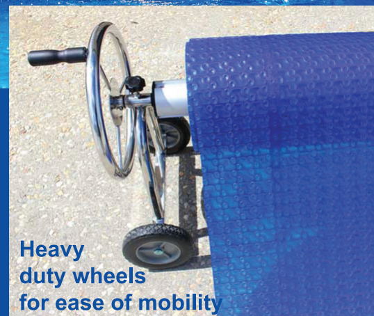
Heavy duty wheels for ease of mobility

The Roller also features 100mm centre tube for strength. Durable design and long lasting components. An easy to use product that will offer years of trouble free service.