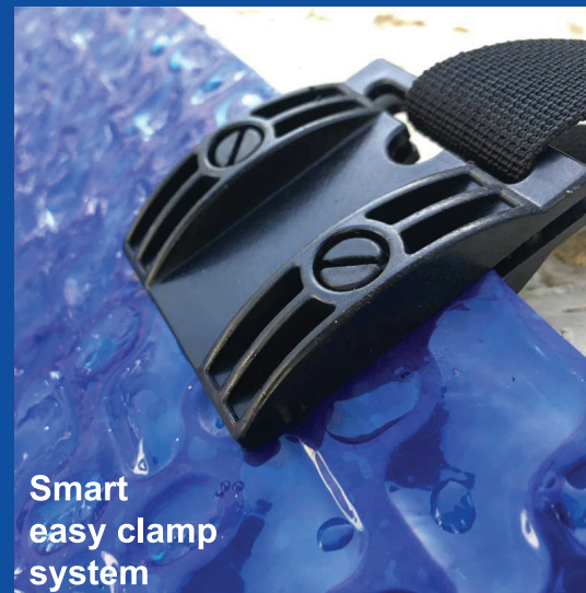
Smart easy clamp system