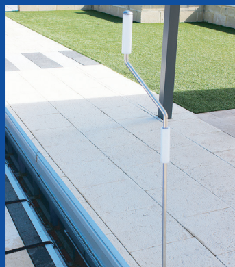
Geared quick wind mechanism