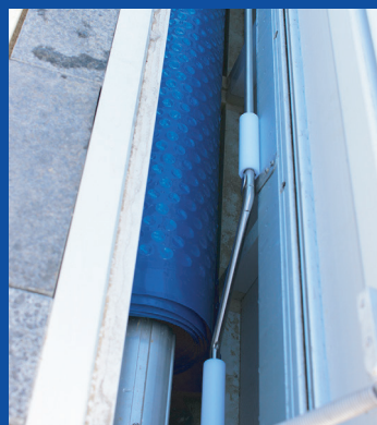
Compact safe storage