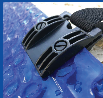
Smart easy clamp system