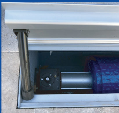
Strong, quality components